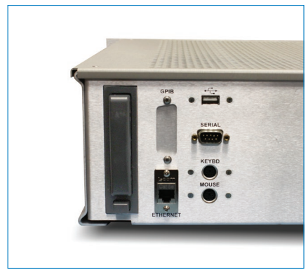
Removable drive - U7opt17