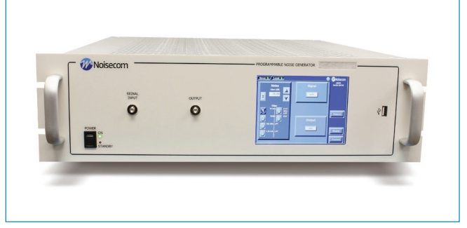
3U High - U7opt18